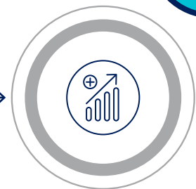
Protecting and enhancing long- term value