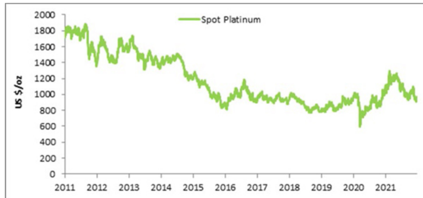
Data from 12/31/10 to 12/30/21. Spot Platinum = PLMLNPM Index

The price of platinum is volatile and fluctuations are expected to have a direct impact on the value of the Shares. However, movements in the price of platinum in the past are not a reliable indicator of future movements. The following chart illustrates the movements in the price of an ounce of platinum in U.S. Dollars from December 31, 2010 to December 30, 2021 and is based on information provided by Bloomberg: